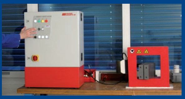
Depending on local regulations, the operator has to keep some distance from the Demagnetizing Coil MM CT-U during the demagnetizing pulse.