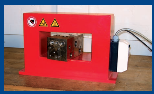
The coils demagnetize reliably even when a very large portion of the available space is used.